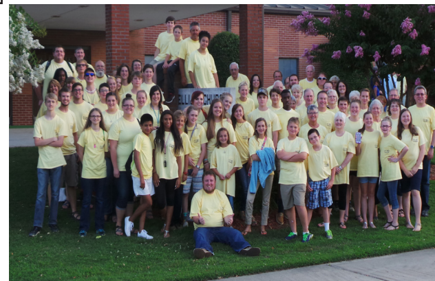
THIS GREAT LOOKING GROUP MADE UP THE IMPACT TEAM FOR 2016! THANK YOU TO EVERYONE WHO PARTICIPATED AND MADE THIS A HUGE SUCCESS.

There will be a short meeting following tonight's evening service for everyone interested in helping with the Homework Club this school year.