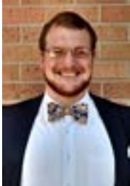
Cut to the Chase

The warm weather this past week has been nice, and yet it has done nothing but torment me with visions of foggy waterfront mornings and fish on the line. I was not able to be much of a hunter growing up. I always wanted to go hunting, but my family are not avid hunters. Fishing on the other hand, I had plenty of practice with. I have spent many days on the lake with a line in the water, relaxing and enjoying being a part of the great outdoors.