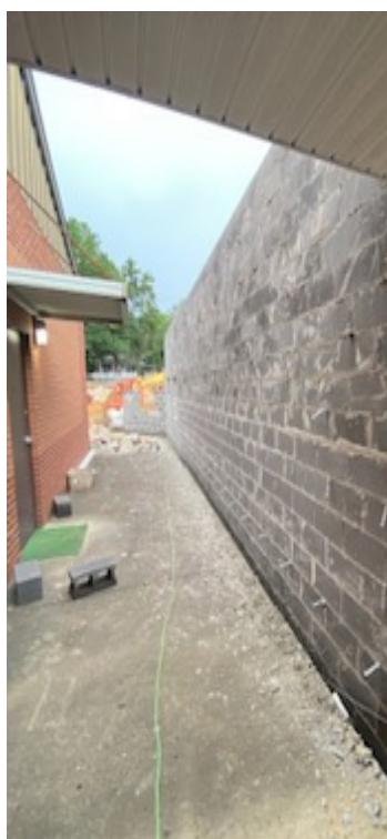
The blocks have started going up!